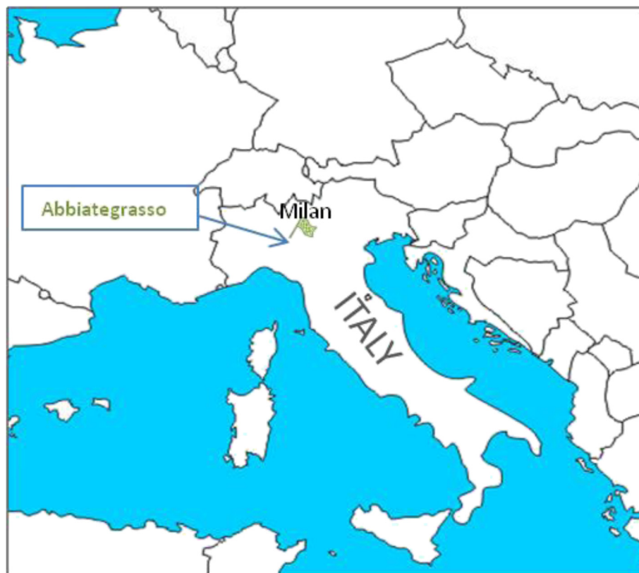
Figure 1 Map of the area of the “InveCe.Ab” study.

Following a single age quintile in a longitudinal study format allows us to minimize the confounding effect of age. The study is being conducted in a specific geographic area; hence, the recruited cohort is homogeneous with